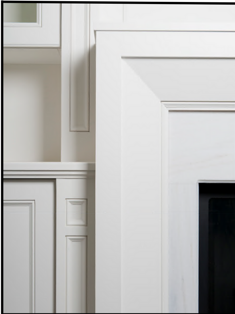
Brenlo Profile 22 & 134

The terms "flat cut" (also known as plain sawn), "quarter sawn," and "rift sawn" refer to different methods of cutting logs into lumber, and these terms can apply to various types of wood, not just oak. Let's dive into the general differences between these cuts: