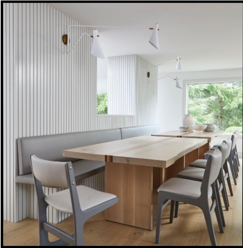
Brenlo Inspo #4

In this issue, we'll discuss the difference between cuts of wood to achieve grain patterns as well as selecting the most durable options for both interior and exterior projects.