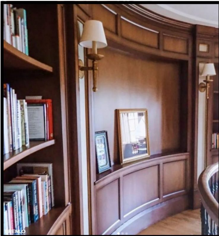
Brenlo Profile 166 in Walnut

The choice of wood species for indoor or outdoor construction depends on several factors, including the project's location, environmental conditions, aesthetics, and the intended use of the wood. Here are some common wood species for both indoor and outdoor construction, along with their suitability for each application.