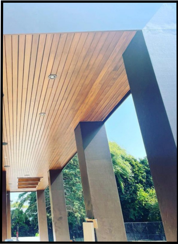
Use Brenlo OCC1x4 in Cedar

Cedar: Cedar is a top choice for outdoor projects, such as decks, fencing, and outdoor furniture. It is naturally resistant to decay and insects.