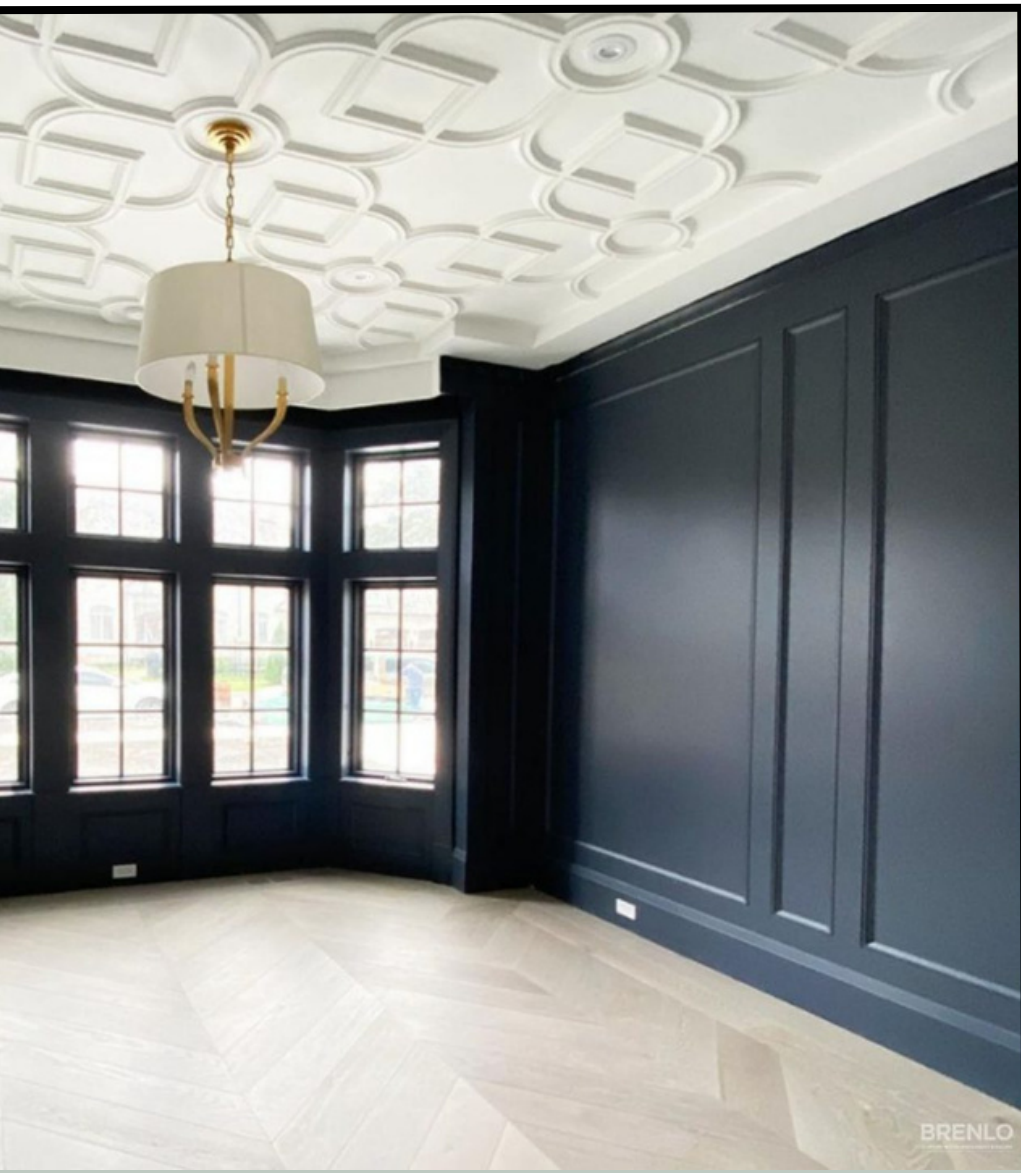
Brenlo Profile 307

Reach out today to get more information!