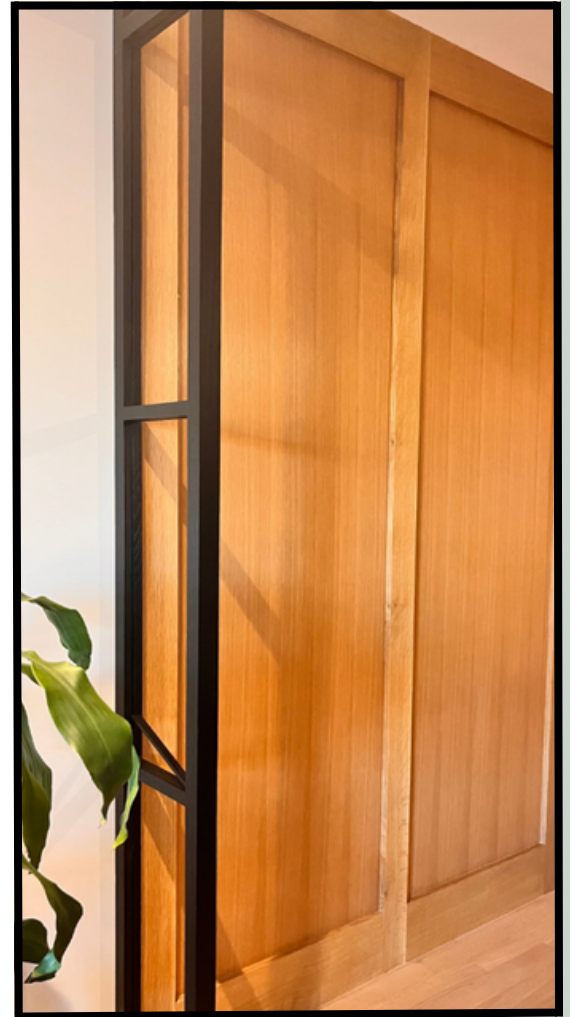
Brenlo Profile D41x2 in Oak

Cedar: Cedar is sometimes used for indoor closets, saunas, and storage projects. Its aromatic properties help repel moths and insects.